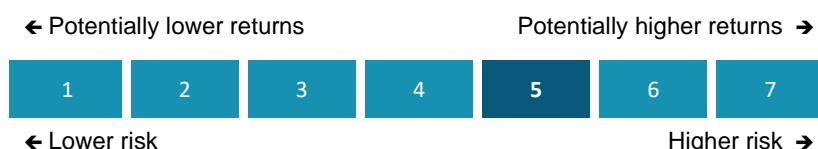
Risk indicator for the IVCM Vanguard LifeStrategy 80% Equity Fund 1

The risk indicator is rated from 1 (low) to 7 (high). The rating reflects how much the value of the fund’s assets goes up and down. A higher risk generally means higher potential returns over time, but more ups and downs along the way.